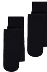
White, grey or black socks, or black or grey tights