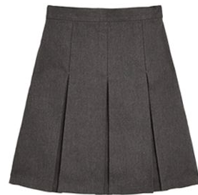
Grey trousers, shorts or a skirt