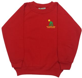
A red jumper/cardigan with school logo (can be bought from Monkhouse or Debonair in the market)