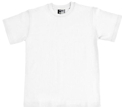
Plain white t-shirt