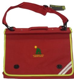
Red book bag