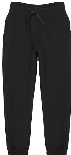
Black shorts, leggings or jogging bottoms for cold weather