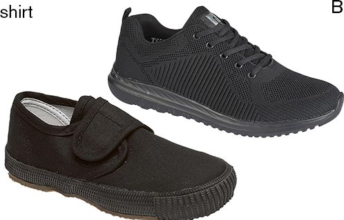
Black pumps or trainers for outside