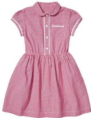
Red summer dress