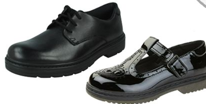
Smart black school shoes