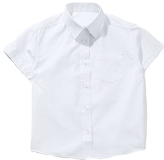
A white shirt/blouse