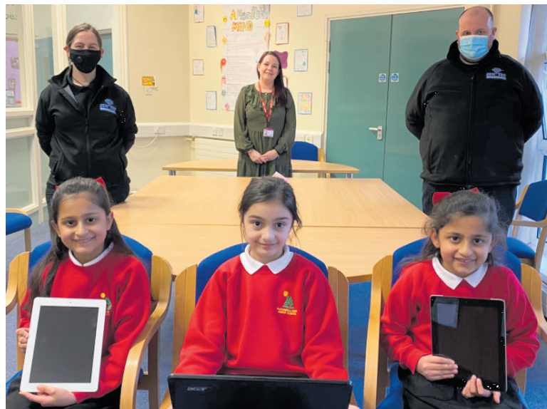
SPECIAL DELIVERY: Pupils at Alexandra Park Junior School with the latest laptop deliveries from Dukinfield's ZenTec Network Solutions.

"We know just how important this will be to them, we can't thank ZenTec enough for how they are supporting schools and pupils in the local area."