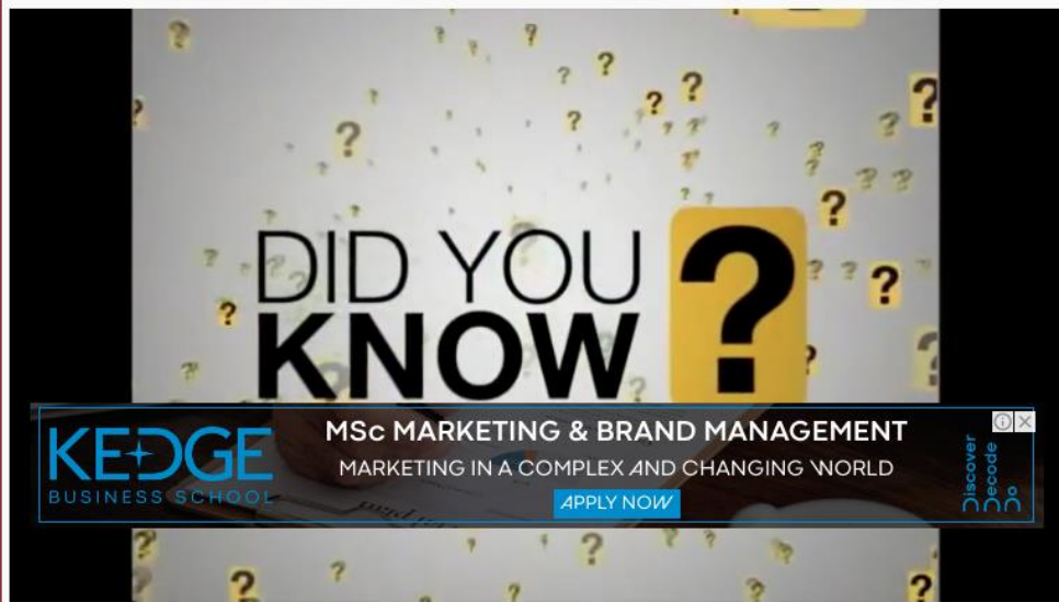
Did You Know (Shift Happens) - 2018 Remix