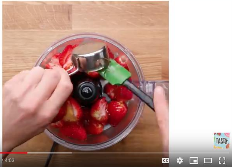
5 Easy 2-Ingredient Recipes