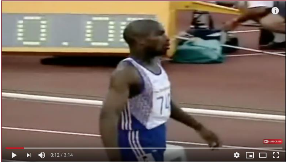
Powerful Inspirational true story...Never give up!