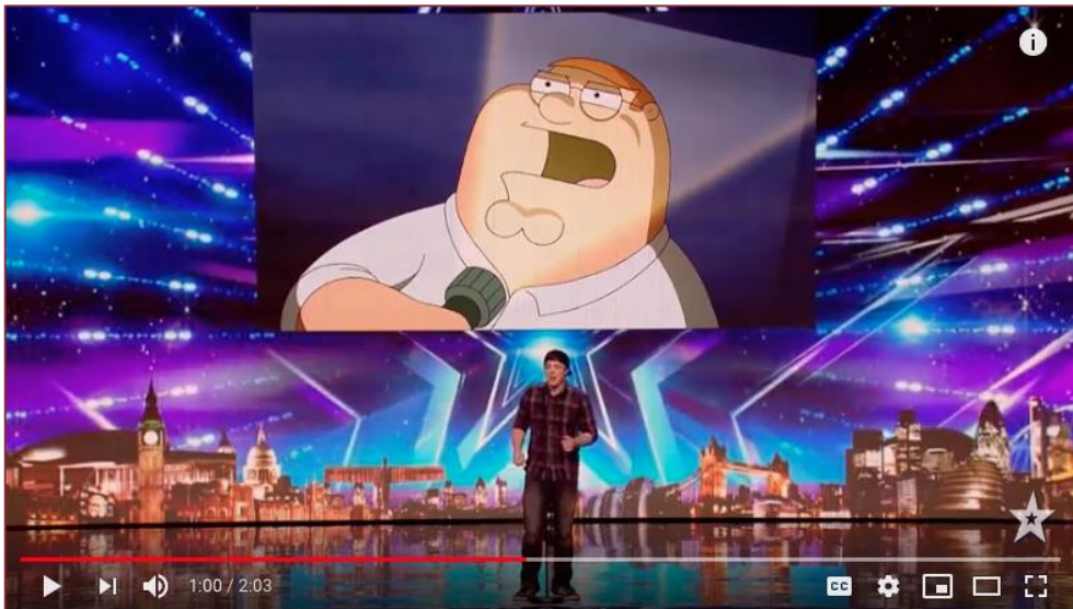
#gottalent #talent Peter Griffin, Elmo & More Sing Wrecking Ball On Britain's Got Talent