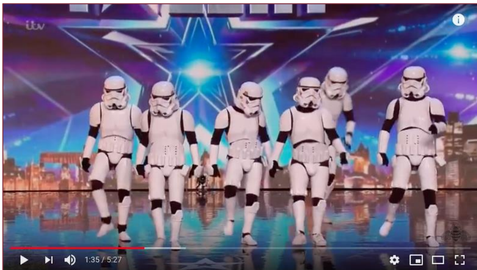
#TonyPatrony Britain's Got Talent 2016 S10E05 Boogie Storm Star Wars Inspired Cosplay Dance Crew Full